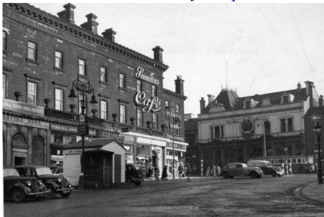
The photographs (above and cropped below left)

The first is of our Hanley branch which was prominently positioned at 11 Market Square Hanley . Our Magazine staff visited Hanley in 1965 and commented: We visited Hanley Branch which has to be seen to be believed. .... Since we worked there on relief in 1937 an adjoining shop has been taken in and every floor above is more than fully occupied.