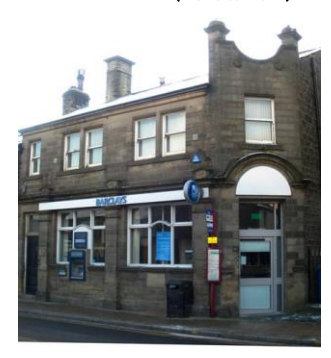
Pre 1918 (left) 2010 (below right) and 2023 (below left)

As a result of our new members' comments about their first branches, I did some