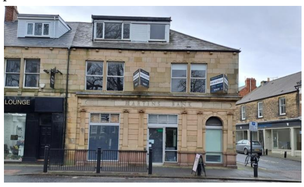
opposite street corner.

And GOSFORTH (below), where some interesting alterations to the ground floor appear to have been undertaken over the years Gallowgate Branch (left in the city centre. This branch was closed on merger day as Barclays had a large branch in a new office block on the