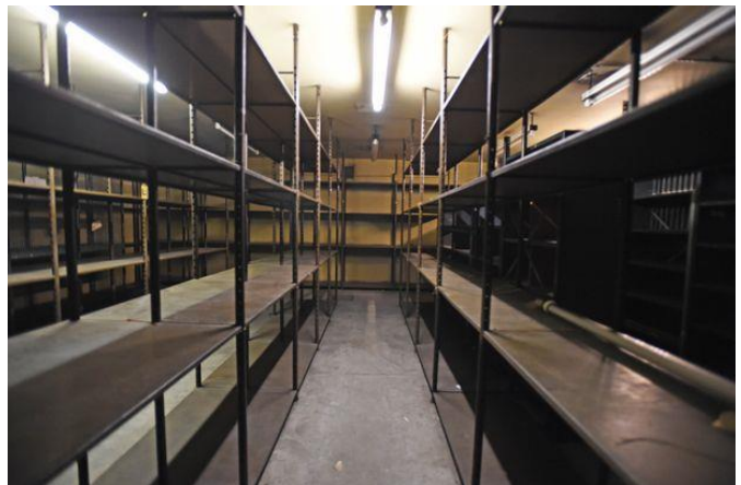
Inside the vault where Britain's gold reserves were stored during World War Two

In 1940, with the threat of German invasion looming, much of Britain's gold reserves were moved to the bank's vault.