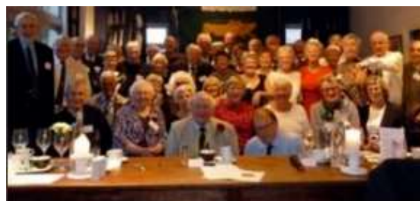
The Martins Bank reunion at the Wheatley Arms, Ben Rhydding.

But first, our 50 th Anniversary Remembrance Lunch was featured on the local newspaper: