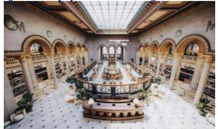
The banking hall inside the Martins Bank Building in Liverpool

It isn't clear what impact this will have on the timetable for the scheme. LBN has attempted to contact both Kinrise and Karrev for comment. Joint agents on the project are Avison Young and CBRE.