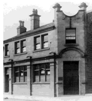
Pre 1918 (left) 2010 (below right) and 2023 (below left)

Now, back closer to (my) home: SILSDEN where I spent many happy hours in the four-man branch, actually three men and one lady; Where little has changed in 'Cobbydale'